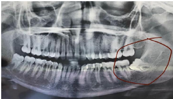
Mesioangular Impaction pre -op