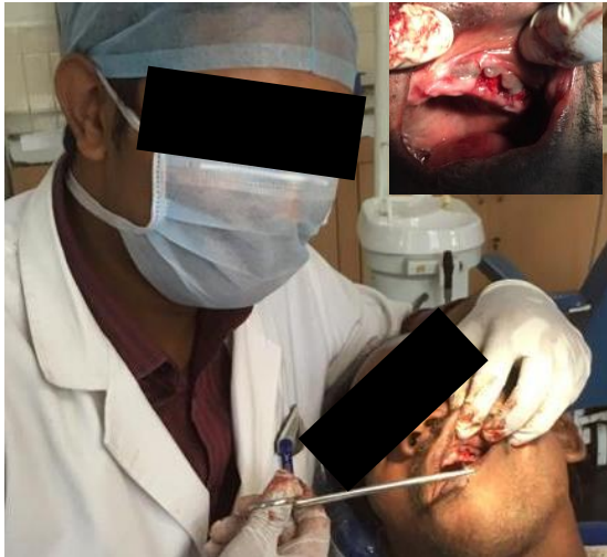
Alveoloplasty and suturing